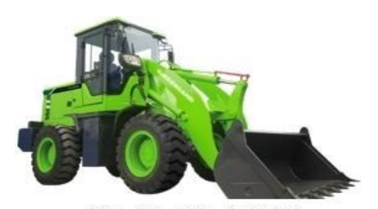
1.8-ton Electric Loader Vehicle

There is increasing demand for electric industrial vehicles powered by sustainable energy in order to reduce air pollution and lower carbon emissions. HEVI's electric industrial vehicle products currently include GEF-series electric forklifts, a series of lithium powered forklifts with three models ranging in size from 1.8 tons to 3.5 tons, GEL-1800, a 1.8 ton rated load lithium powered electric wheeled front loader, and GEX-8000, an all-electric 8.0 ton rated load lithium powered wheeled excavator. These products have become available for purchase in the U.S. market. In July 2022, HEVI launched its new GEL-5000 all-electric 5.0 ton rated load lithium wheeled front loader. HEVI plans to establish an assembly site and an experience center in the United States in 2022 to support local sales, assembly and distribution.