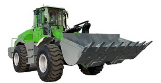
GEL-5000 Electric Wheel Loader

Offering all-electric clean and sustainable alternatives to traditional heavy-emission systems in the industrial heavy equipment industry, HEVI sells equipment that produce no operating emissions and reduced noise pollution while offering the strength and power for many applications. Assembled in Maryland, HEVI's first product line includes the GEL-5000 and GEL-1800 electric wheeled front loader, the GEX-8000 electric excavator and the GEF-series of electric lithium forklifts.