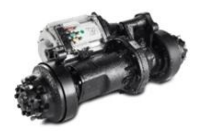
2.5-ton Integrated Powertrain

Transmission Systems. For 15 years, Greenland, along with its subsidiaries, specializes in designing, developing, and manufacturing a wide range of transmission systems for material handling machineries, in particular forklift trucks. The range of the transmission systems covers machineries from one ton to fifteen tons. Most transmission systems contain auto transmission features. This feature allows for easy machine operations. In addition, Greenland provides transmission system for internal combustion powered machineries as well as for electrical powered machineries. Greenland has recently experienced an increasing demand for electric powered transmission systems. These transmission systems are key components for material handling machinery assembly. To meet this increasing demand, Greenland is able to providing these transmission systems to major forklift truck original equipment manufacturers ("OEMs") as well as certain global branded manufacturers.