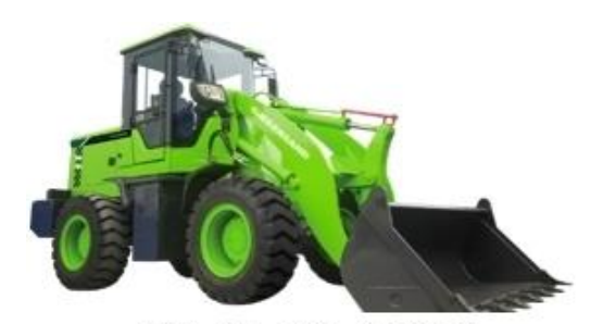
1.8-ton Electric Loader Vehicle

There is increasing demand for electric industrial vehicles powered by sustainable energy in order to reduce air pollution and lower carbon emissions. In December 2020, Greenland launched a new division to focus on the production and sale of electric industrial vehicles—a division that Greenland intends to develop to diversify its product offerings. Greenland's electric industrial vehicle products currently include GEF-series electric forklifts, a series of lithium powered forklifts with three models ranging in size from 1.8 tons to 3.5 tons, and GEL-1800, a 1.8 ton rated load lithium powered electric wheeled front loader. In February 2022, Greenland launched its GEX-8000 all-electric 8.0 ton rated load lithium powered wheeled excavator. These products have become available for purchase in the U.S. market. Greenland plans to establish an assembly site and an experience center in the United States in 2022 to support local sales, assembly and distribution.